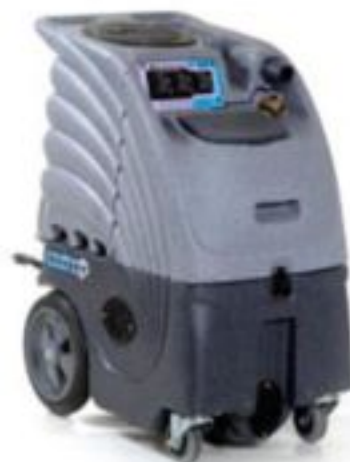
Sniper-6 Wand 12" Single Band 1 Jet Part# 80-8008