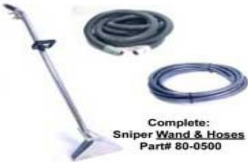
Complete: Sniper Wand & Hoses Part# 80-0500