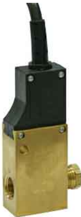
EZ Power: Low flow Switch to convert pressure washer for carpet cleaning [ezlowflo]

If you are going to use the optional 18 gallon tank you must also use a fuel primer bulb and check valve on system.