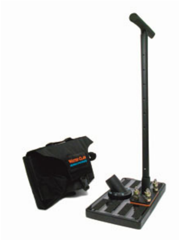
San Antonio TX Medium Water Claw (Machine Equipment Rental)