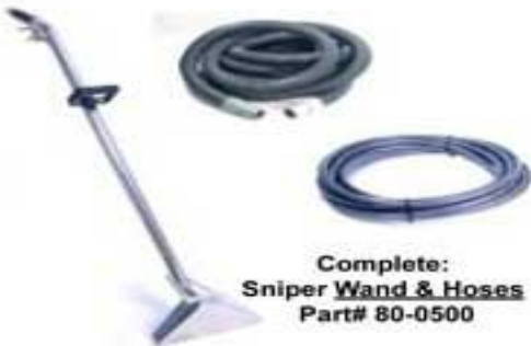
Complete: Sniper Wand & Hoses Part# 80-0500