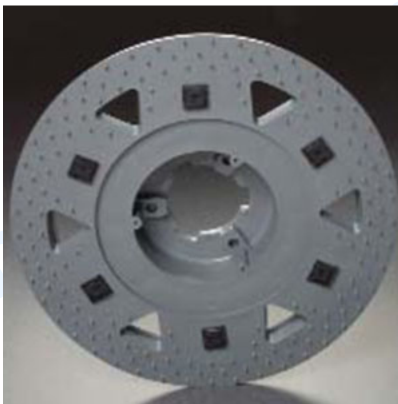
Malish: TriLok - 14 inch Pad Driver (trilock)