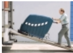
Exclusive safety control features friction brake system and 10 speed variable drive