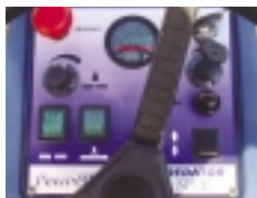
Simple easy to operate control panel with forward and reverse drive.