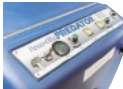
Dial sets variable pad/brush pressure from 88 to 175 lbs at 225 rpm to match the cleaning task.