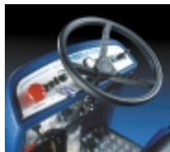
Easy to reach safety features and controls.