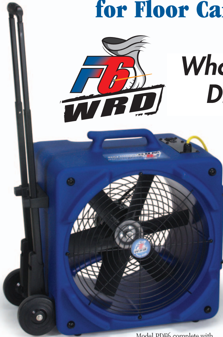
Model PDF6 complete with telescopic handle and wheels.